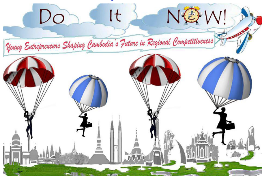
Student Academic Leadership Conference December 12-17, 2016 School of Business Poster-Making Contest